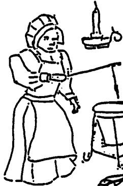
HANDS ON NATURE TRAIL & GAMES

Candle Dipping Blacksmithing Soap Making Antique Games And More